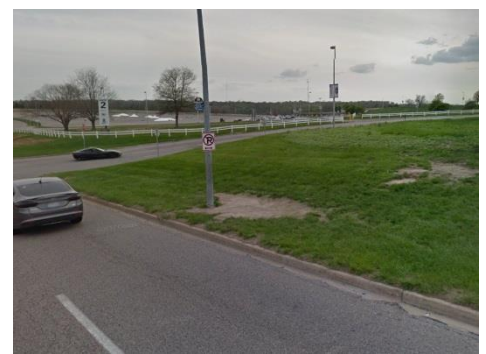
Old Truman Complex stop

The KCATA partnered with the Jackson County Sports Complex Authority recently to add a shelter and sidewalk at Blue Ridge Cutoff and 41 st Terrace near Kauffman and Arrowhead Stadiums.