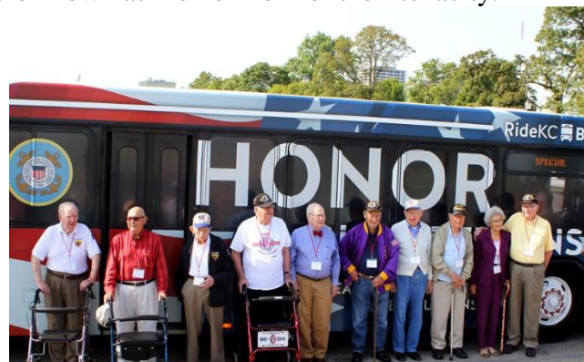
The 'Iron Men of Metz' snap a photo in front of the RideKC bus honoring veterans. The bus took them to the National World War I Museum and Memorial.

The 3 rd Army overcame a complex subterranean network of forts, bunkers and pill boxes that made Metz a formidable challenge against an assault.