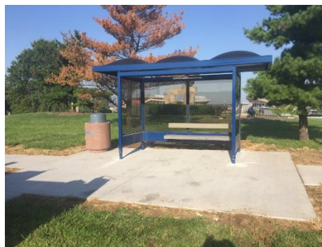
New Truman Complex stop

The Kansas City Area Transportation Authority has made sure its Kauffman Stadium stop won’t be winning this year’s sorriest bus stop.