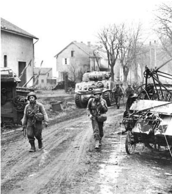
Infantry from the 95 th enter the fortified city of Metz in November 1944 toward the end of World War II.

The city was surrounded by hills that were turned into underground forts with a series of interconnecting tunnels.